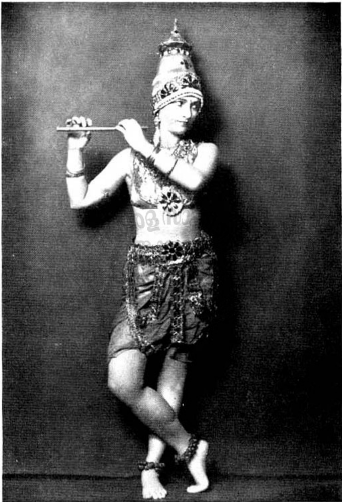
Krishna — The Divine Flute Player